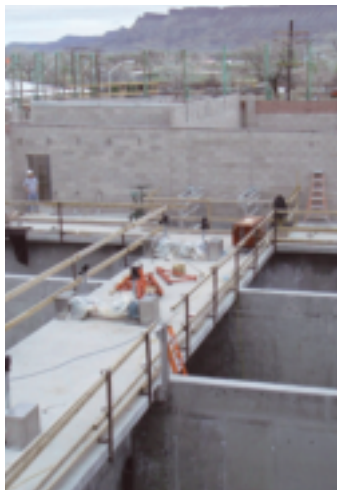
Construction of our new pretreatment facility

The sources of drinking water (both tap water and bottled water) include rivers, lakes, streams, ponds, reservoirs, springs, and wells. As water travels over the surface of the land or through the ground, it dissolves naturally occurring minerals and, in some cases, radioactive material, and can pick up substances resulting from the presence of animals or from human activity. Contaminants that may be present in source water include: