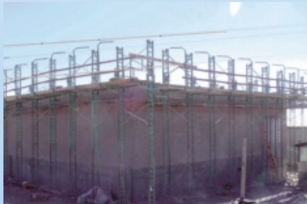
Construction of our new 16 million gallon per day, pre-treatment facility

In addition to the contents seen on the enclosed Water Quality Table, the Clifton Water District tested for over 100 other contaminants that were not detected. The Clifton Water District had an average effluent turbidity of 0.027 NTU for 2005.