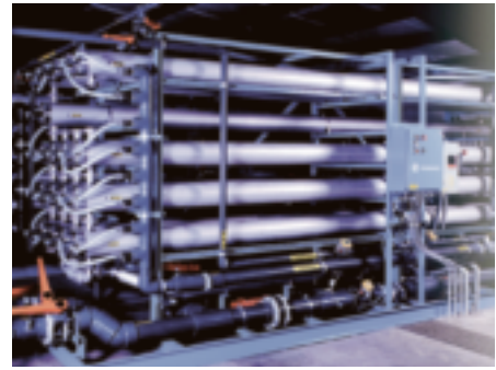
Reverse osmosis membrane facility

Clifton Water District's drinking water meets or exceeds all Environmental Protection Agency and Colorado Department of Health and Environment regulations. However, all drinking water, including bottled water, may reasonably be expected to contain at least small amounts of some contaminants. The presence of contaminants does not necessarily indicate that the water poses a health risk. Immuno-compromised persons such as persons with cancer undergoing chemotherapy, persons who have undergone organ transplants, people with HIV/AIDS or other immune system disorders, some elderly, and infants can be particularly at risk of infections. These people should seek advice about drinking water from their health care providers. For more information about contaminants and potential health effects, or to receive a copy of the U.S. Environmental Protection Agency (EPA) and the U.S. Centers for Disease control (CDC) guidelines on appropriate means to lessen the risk of infection by cryptosporidium and microbiological contaminants call the EPA Safe Drinking Water Hotline at 1-800-426-4791